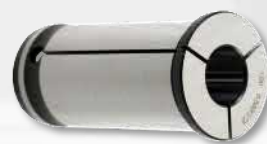
MC Collets (Sold Separately)