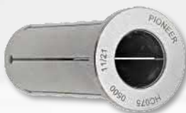
HC Sealed Collets (Sold Separately)